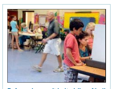
Referendun can't halt girl's softball field