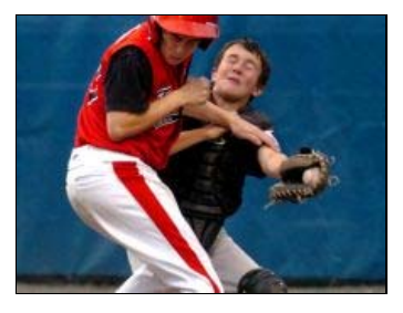
Fairfield Little Leaguers, with 10-8 win, on verge of World Series